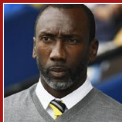
Jimmy Floyd Hasslebaink