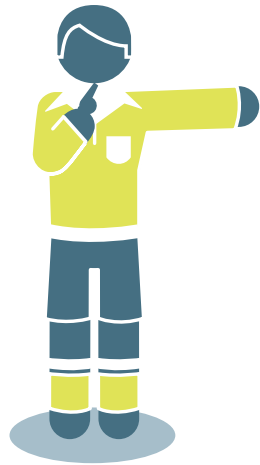
Direct free kick