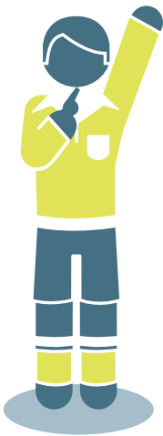
Indirect free kick