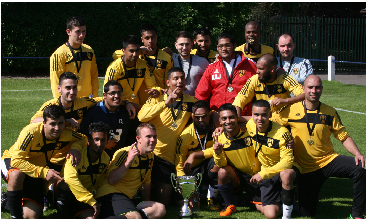
BIRMINGHAM COMMUNITIES LEAGUE CHAMPIONS SALTLEY STALLIONS FC