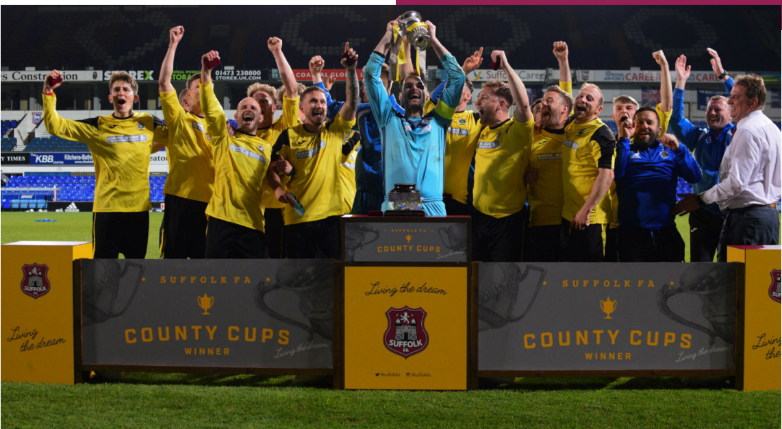
AFC Kesgrave celebrate after defeating Trimley Red Devils 3-2 to win last season's Suffolk Junior Cup Final at Portman Road

KBB NEFF Suffolk Junior Cup Final: Bildeston Rangers (blue & white) v Bacton Utd '89 (red & green). Adults £6, concessions £3, children £1.