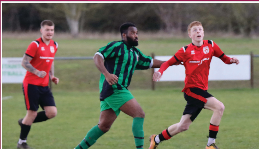
STANTON (red shirts) in action in their 5-0 victory over Ipswich Athletic (green & black striped shirts) in the third round of this season's competition