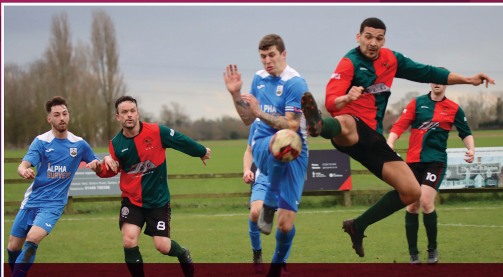
THURSTON (blue shirts) challenging for the ball during their 4-1 win at Bacton United 89 in the third round of this season's competition