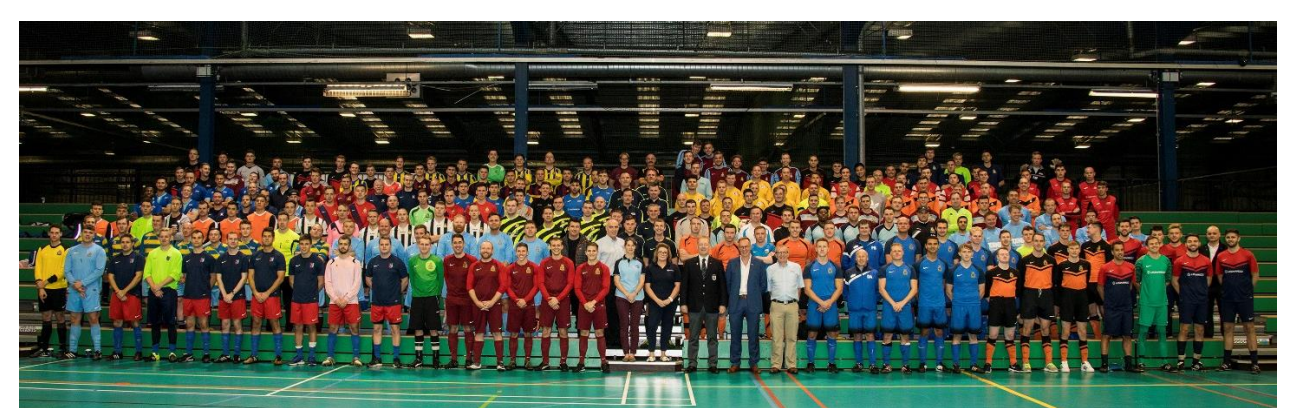
Festival of Football – Manchester - Oct 2017

works for the Football Association as a County Coach Developer