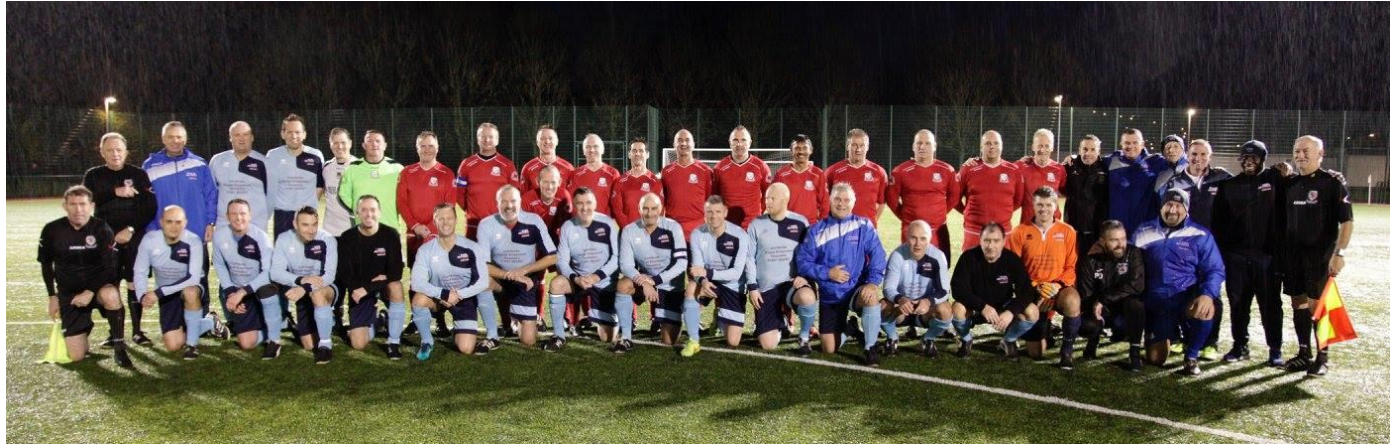
Pic 2 v Wales Vets FC Nov 2017 at CCB Centre For sporting Excellence, Hengoed, Caerphilly

With a total of 15 events organised from the outset, the RAFFA vets family set an ambitious target to raise of £10,000 for the RAF Benevolent Fund in this season until year end 2018. Due to the extreme bad weather, 2 events have been cancelled however, we are still quietly confident of achieving our target of £10,000 by year end. The RAFFA Vets have purposely tried to engage with as many locations as possible as part of the RAF100 celebrations. This has seen us play in Cyprus at the Akrotiri 7's in Cyprus, against a Highland League select team at Forres in Scotland, and also against the Welsh FA Veterans at Caerphilly in Wales. Other locations have seen us compete in