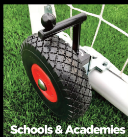
Schools & Academies