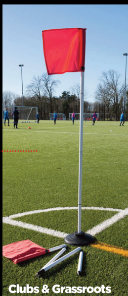
Clubs & Grassroots