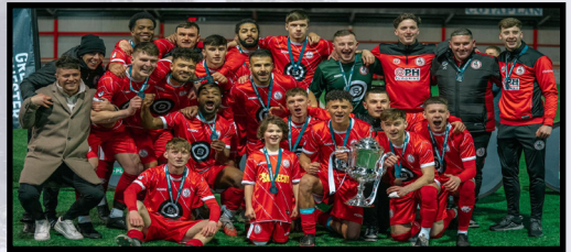
2023 Winners: Chadderton Reserves