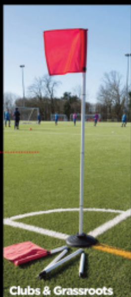
Clubs & Grassroots