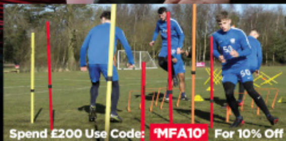
Spend £200 Use Code: 'MFA10' For 10% Off