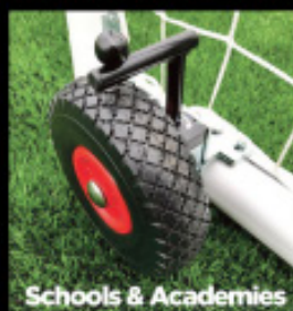
Schools & Academies