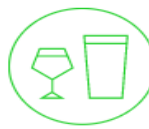
Clubhouse refurb works