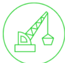
Multiple large works