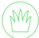
Small sided & recreational