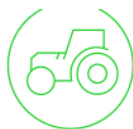
Major grass pitch works