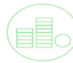
Pitch improvement revenue grant