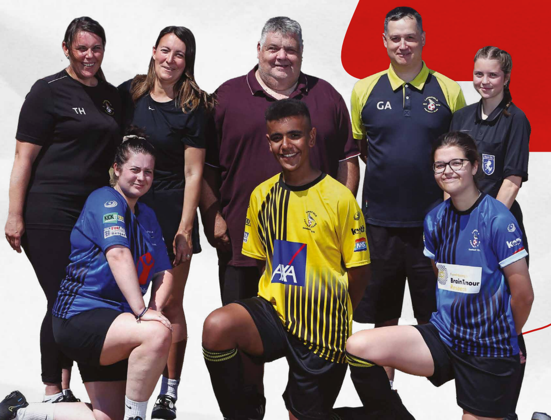
2022 winners Larkfield FC