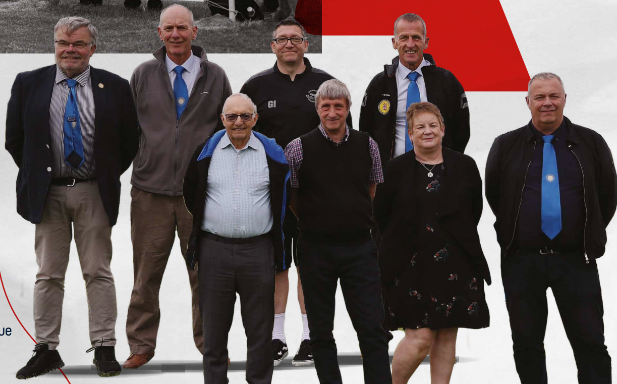
2022 winners York Football League