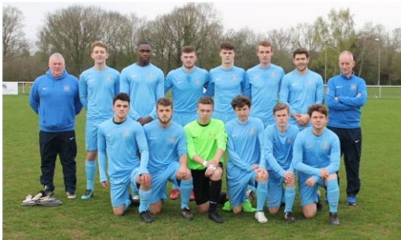
Our U18 team play in the South East Counties Youth Championship and FA Youth Cup