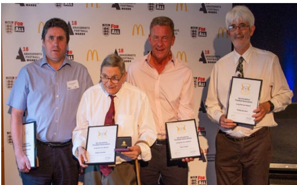
The evening also saw the presentation of a number of Long Service Awards