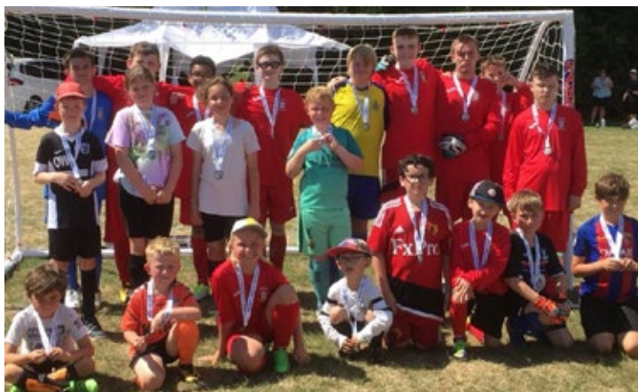
Inclusive Football Festival hosted by Royston Town FC