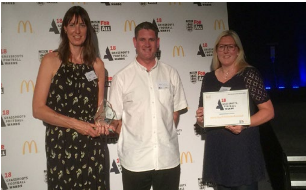
Herts Youth Inclusive Football, winners of Community Project of the Year