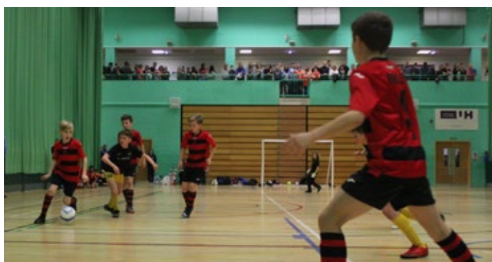
Action from the Hertfordshire FA Youth Futsal Cup in April 2018