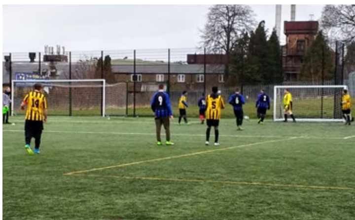
Hertfordshire teams taking part in the FA People's Cup

Pan disability football is well established in Hertfordshire, with adult teams participating in the Herts Senior County Inclusive League and Youth teams playing in tournaments and festivals organised by Herts Youth Inclusive Football.