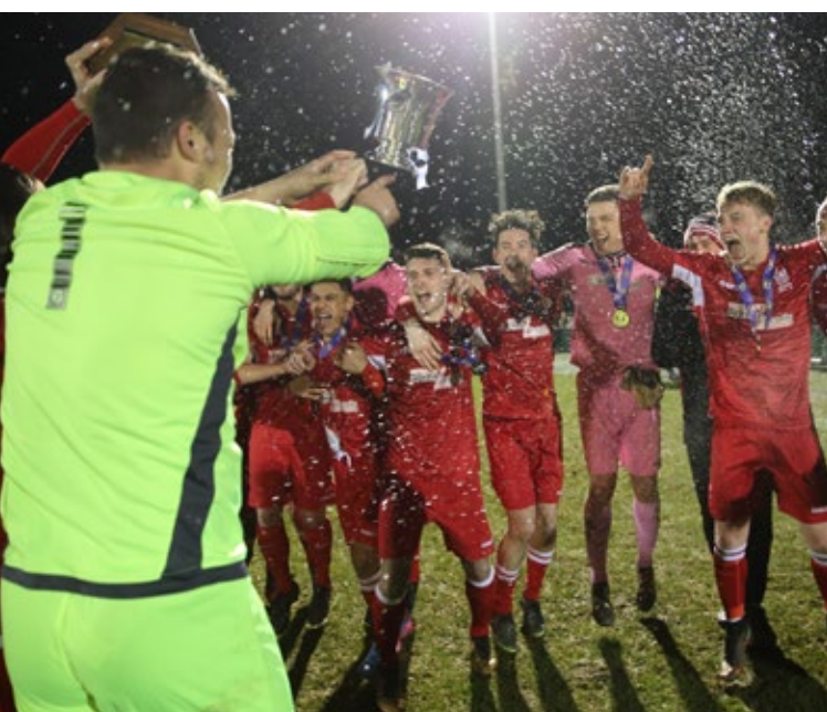
Baldock Town celebrate after winning the Senior Trophy

The youth competitions were each dominated by a single club this year, with Garston Ladies claiming three trophies across the different girls age groups, while Ware FC Academy did the same in the boys...an impressive achievement by both clubs.