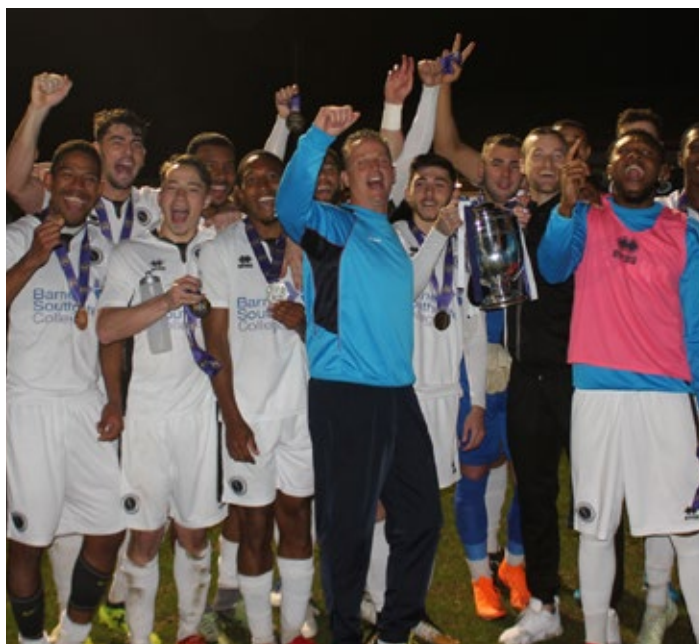
Boreham Wood FC celebrate after winning the Senior Cup