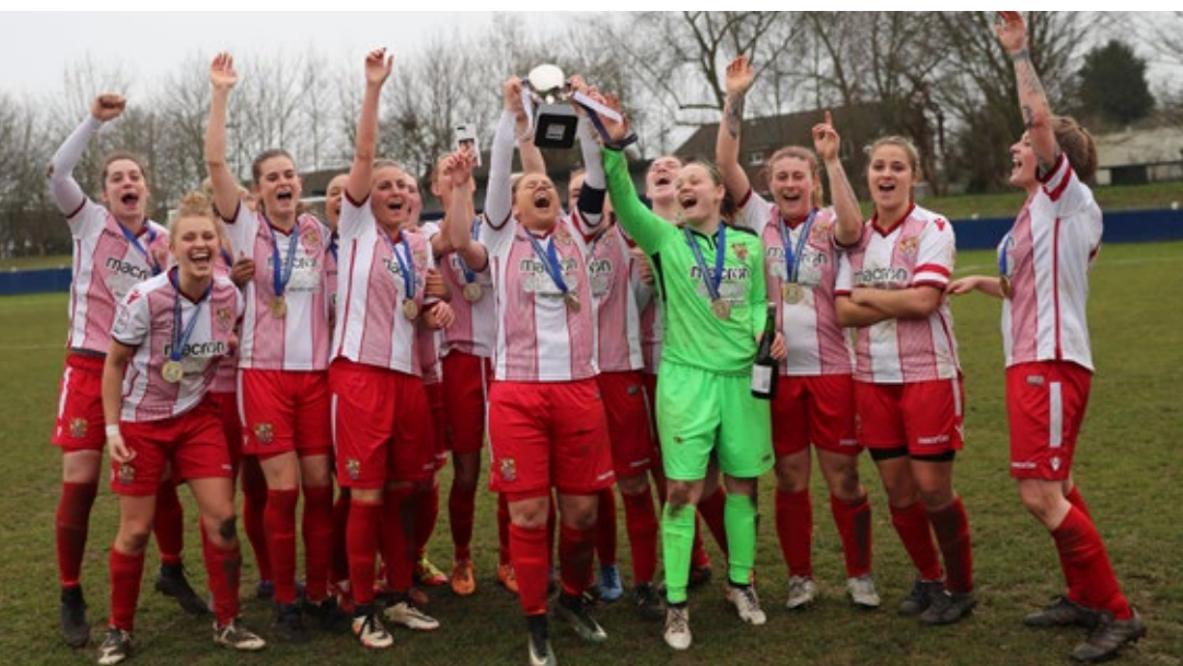
Stevenage Ladies FC celebrate after winning the Women's Cup