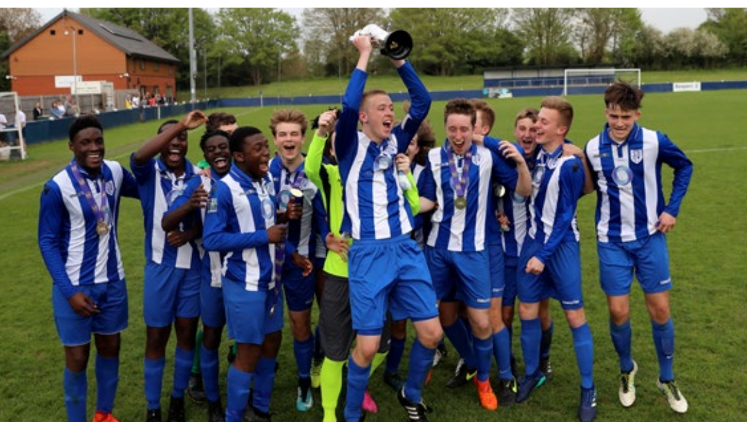
Ware FC Academy celebrate after winning the Under 16 Boys Cup