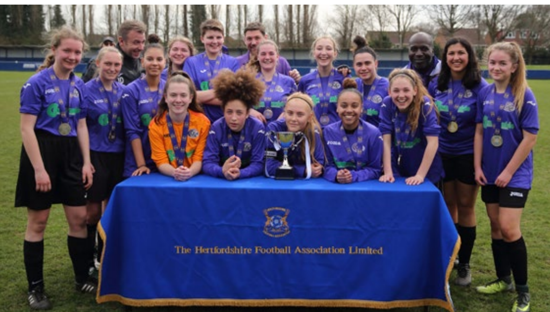
Garston Ladies celebrate after winning the Under 16 Girls Cup