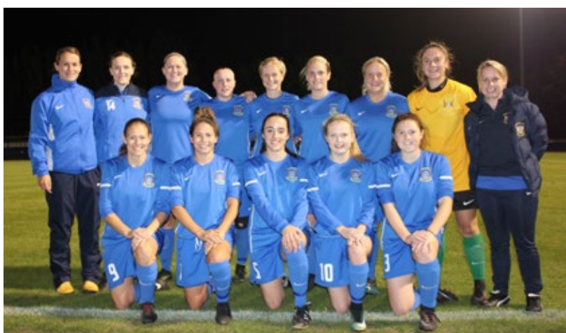
Our Women's team play in the Southern Counties Cup

Representative Football is an important part of the game in the county and it's no small honour to be called up to play for Hertfordshire. We run two representative teams, U18 Boys and open age Women's, each competing in inter-county competitions.