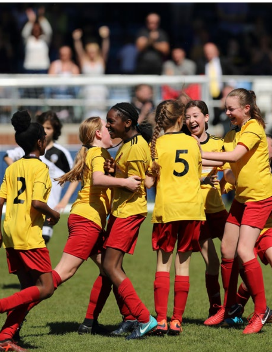
Watford FC Academy celebrate a goal during the Under 12 Girls Cup Final

The Hertfordshire FA County Cups provide an opportunity for local clubs to put their skills to the test against clubs from across the county and experience the magic of a knockout competition.