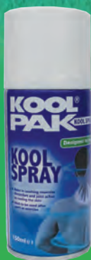
Kool Spray £2.64