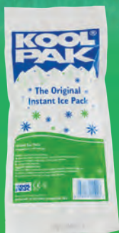
Koolpak Original Ice Pack 78p per pack