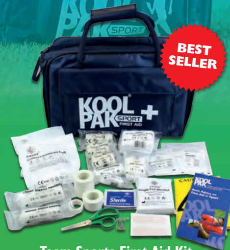
Team Sports First Aid Kit £26.05