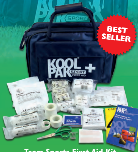
Team Sports First Aid Kit £26.05