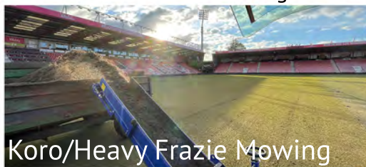
Koro/Heavy Frazie Mowing