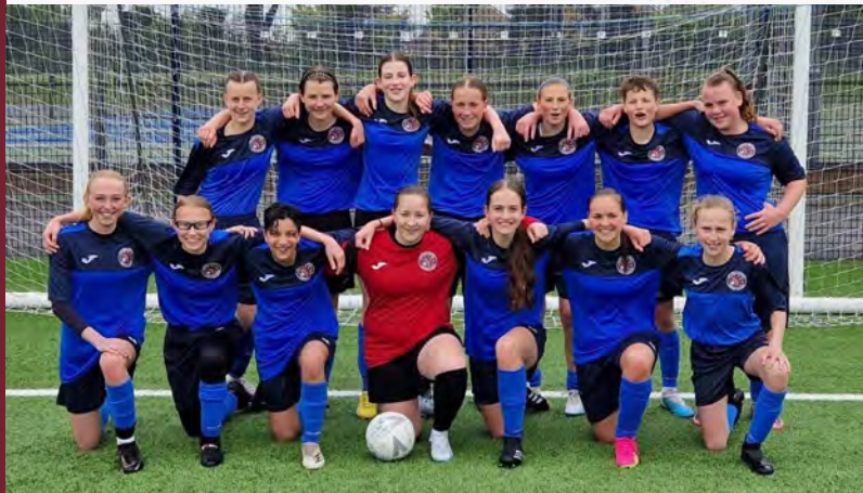
Saturday U14 Girls Cup Final

The club is looking to grow and is holding JPL Warriors Trials for girls in the U11-U18 age groups for the 2023-24 Season in June.