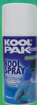
Kool Spray £2.64