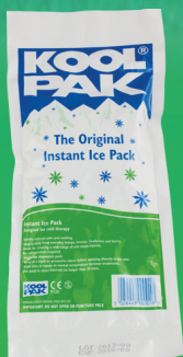
Koolpak Original Ice Pack 78p per pack