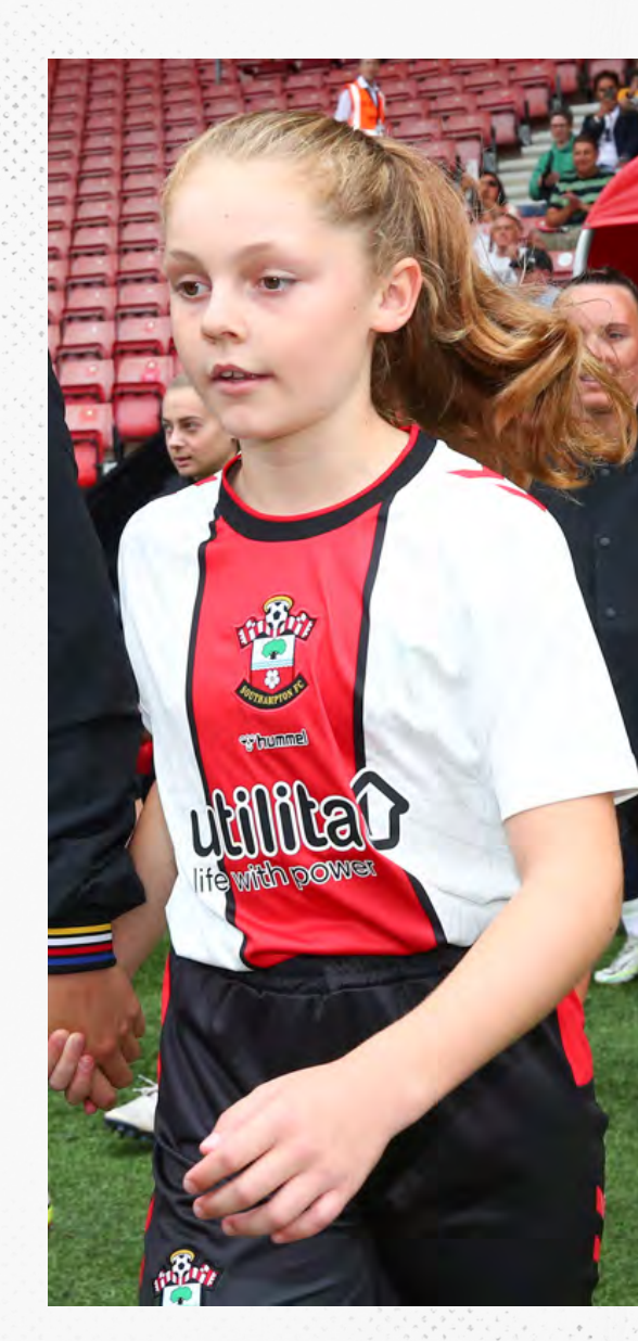
Saturday U12 Girls Cup Final