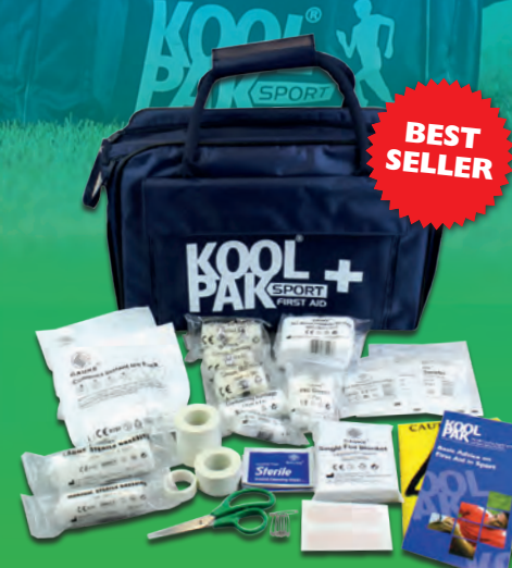
Team Sports First Aid Kit £26.05