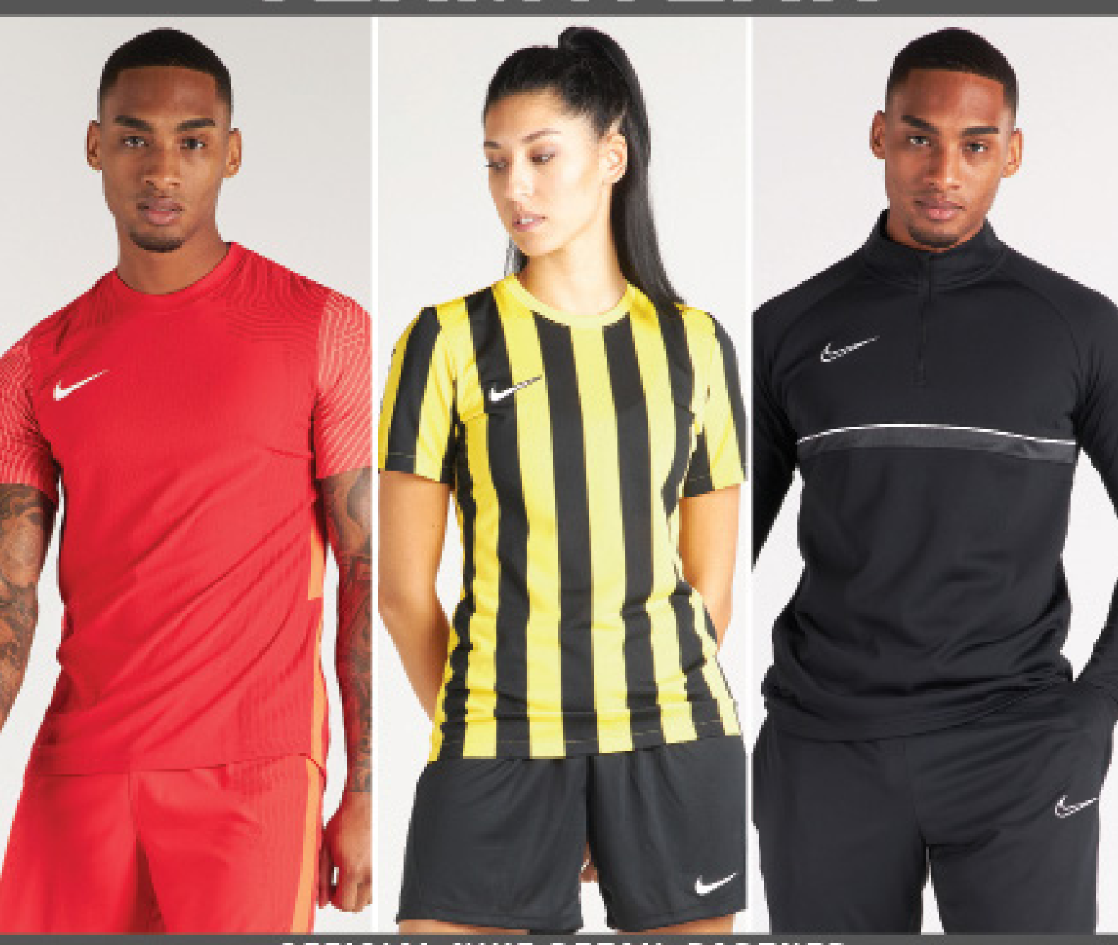
OFFICIAL NIKE RETAIL PARTNER