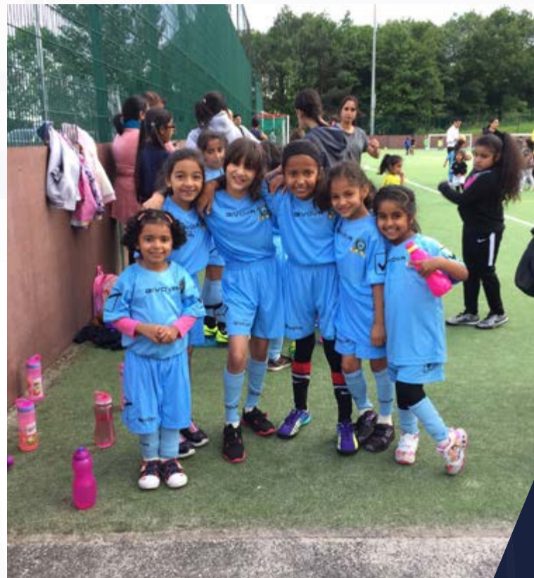
The Wildcats' programme for 5-11-year-old girls has proved a popular way to engage girls from all communities and backgrounds.