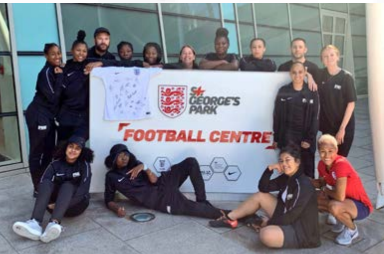
A joint FA and Football Beyond Borders Leadership Camp was held at St. George's Park in August 2019. Also attending was Lioness legend Rachel Yankey (bottom right).

Here's a summary of some of the equality, diversity and inclusion work we have supported in the last 12 months: