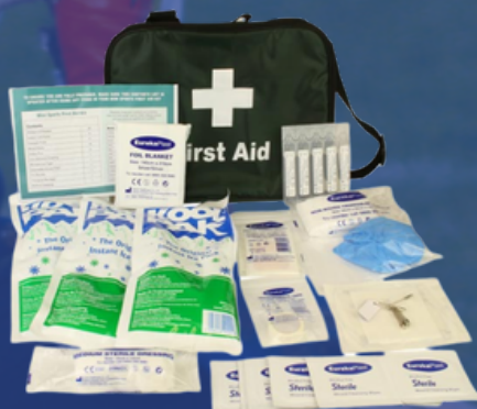
FIRST AID KITS