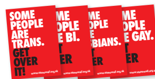
Some People Are... Campaign