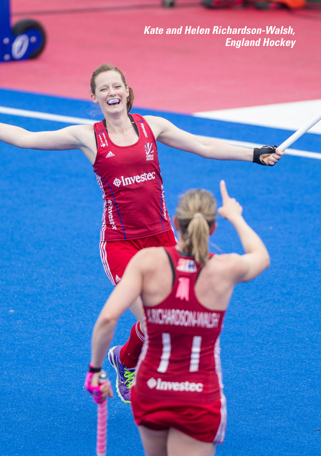
Kate and Helen Richardson-Walsh, England Hockey