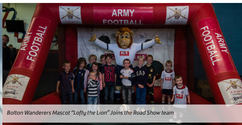
Bolton Wanderers Mascot "Lofty the Lion" Joins the Road Show team