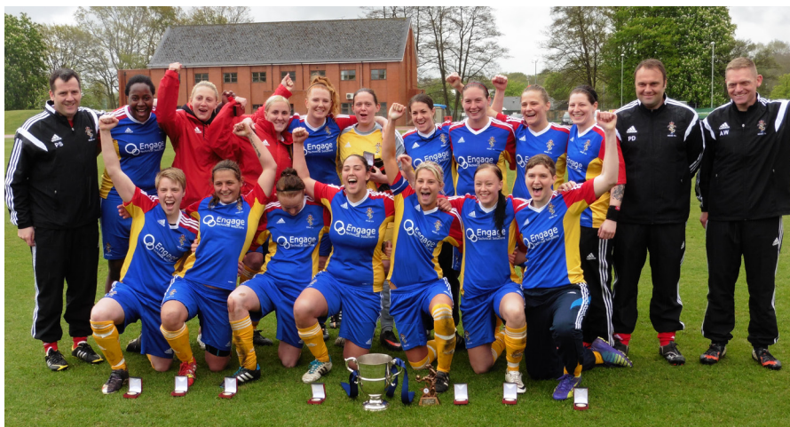
Right, REME Women's FC – Winners of the Edwards Challenge Cup (for a consecutive 2nd year)