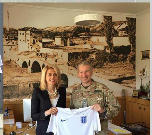
Mayor of Gjakova - Mimoza Kusari Lila