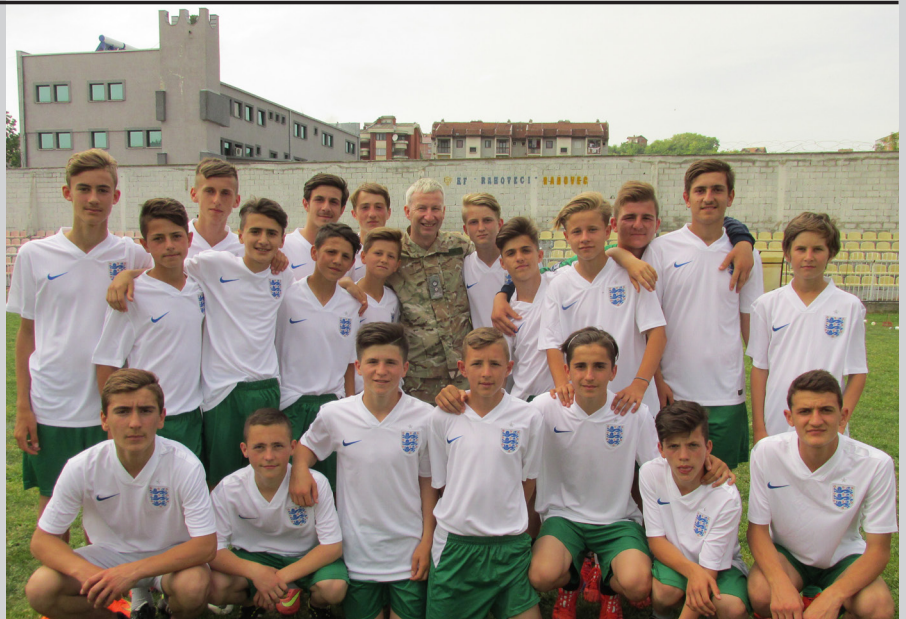
Football Club Shkolla