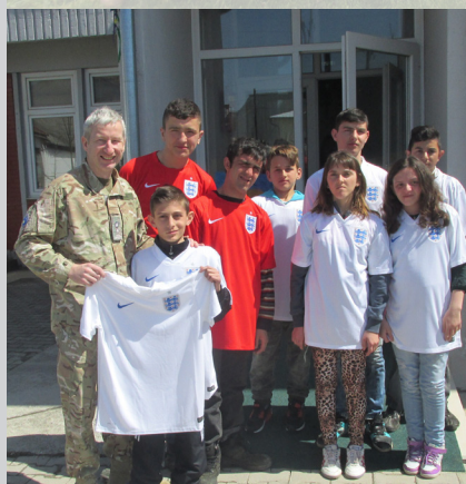
One to One Children's Charity Ferizaj