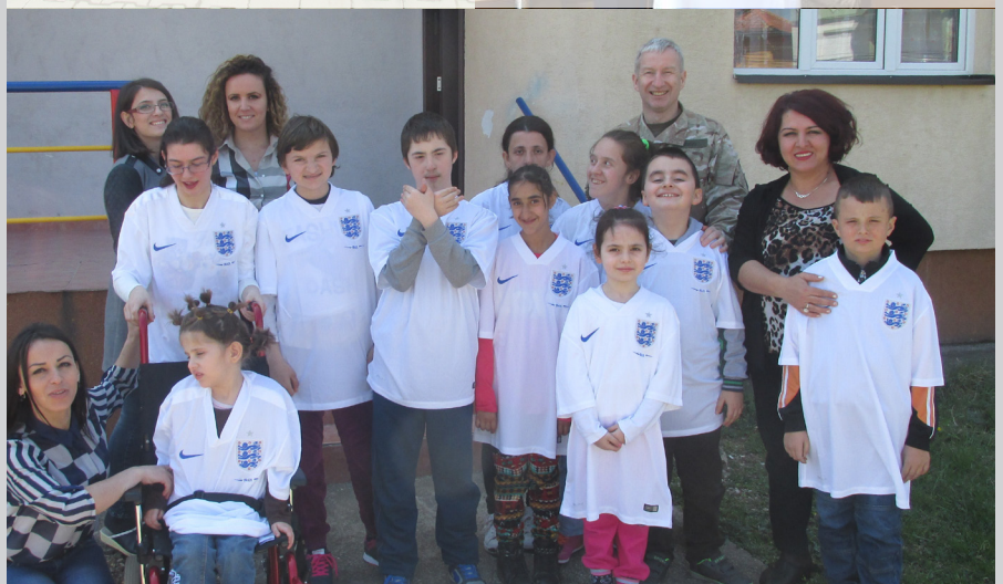
One to One Children's Charity Peja