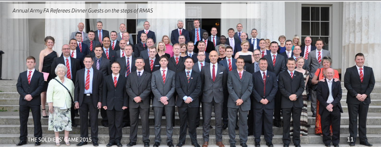
Annual Army FA Referees Dinner Guests on the steps of RMA Sandhurst