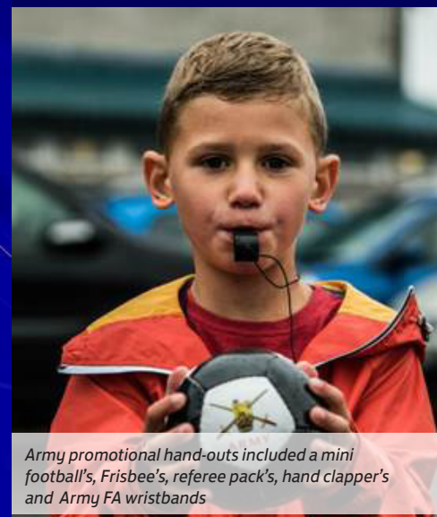
Army promotional hand-outs included a mini football's, Frisbee's, referee pack's, hand clapper's and Army FA wristbands

The clubs we visited can be seen on the road show map left.