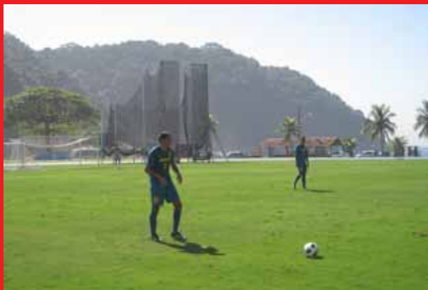
Brazil Captain 'Mr Yellow Card'