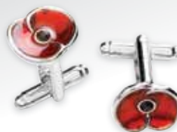
Poppy Enamel Cufflinks JW1048 £12.99