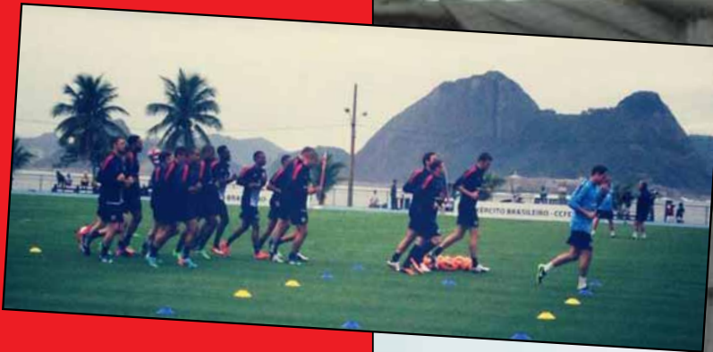
Watching the England Training Session

We were invited by the English Football Association to attend the England Training session on Friday 31 May and England V Brazil at the Maracana Stadium on Sunday 2 June, in which we had the opportunity to meet the England Squad.