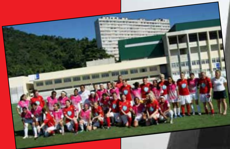
Army FV and the Brazilian League Champions