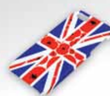
Union Poppy iPhone Cover iPhone 4 - CS1052 iPhone 5 - CS1053 £9.99

From sportswear to T-shirts, cufflinks to phone covers browse over 200 fantastic products online or call 0300 123 9110