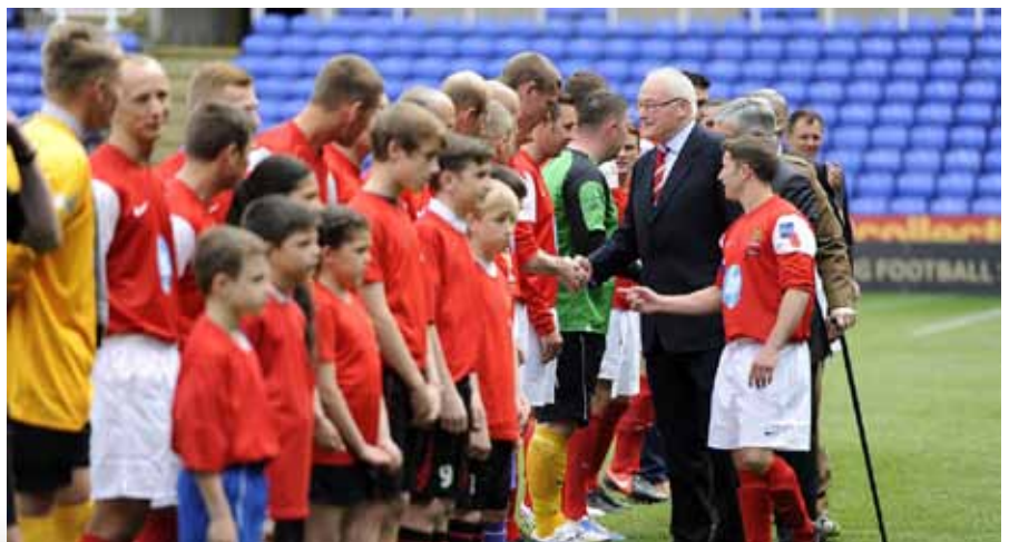
CGS General Sir Peter Wall meets the teams

"In professional football we are essentially here to entertain but the soldiers put their