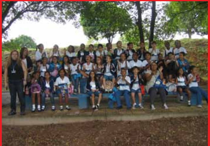
The loyal home supporters!