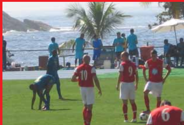
Tough conditions for the team but nice view for the fans!

the Brazilian Capt being nick named 'yellow card' for his constant request (jokingly) for a card to be shown to our players, the game was conducted in Great Spirit.