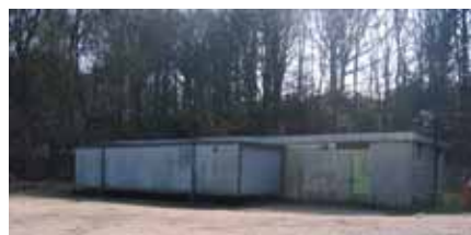
Old Football Development Centre, Clayton Barracks Aldershot

The previous centre for those that knew it, was converted from garages behind Clayton Barracks in Aldershot using Army Football Association funding in 2006. During the intervening period approximately 7000 individuals passed through the facility. The new centre, which has disabled access, will now be in a position to assist Battle Back in delivering courses to disabled soldiers.