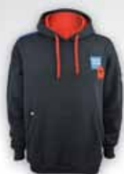
Navy Hoodie CL1120 £34.99