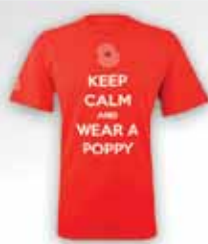
Keep Calm T-shirt - Red CL1217 £13.99