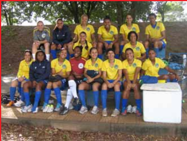
The victorious women's Host team (despite a suspect Ref decision)