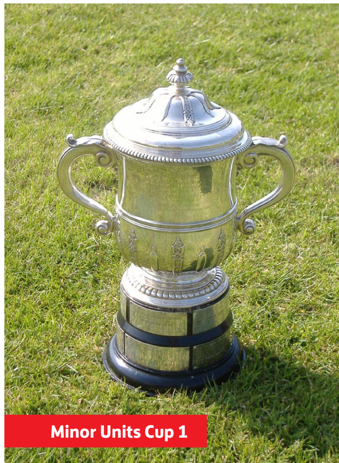
Minor Units Cup 1

Match 1 5 Regt AAC v ArmCen Match 2 ATR Winchester 4-0 47 Regt RA