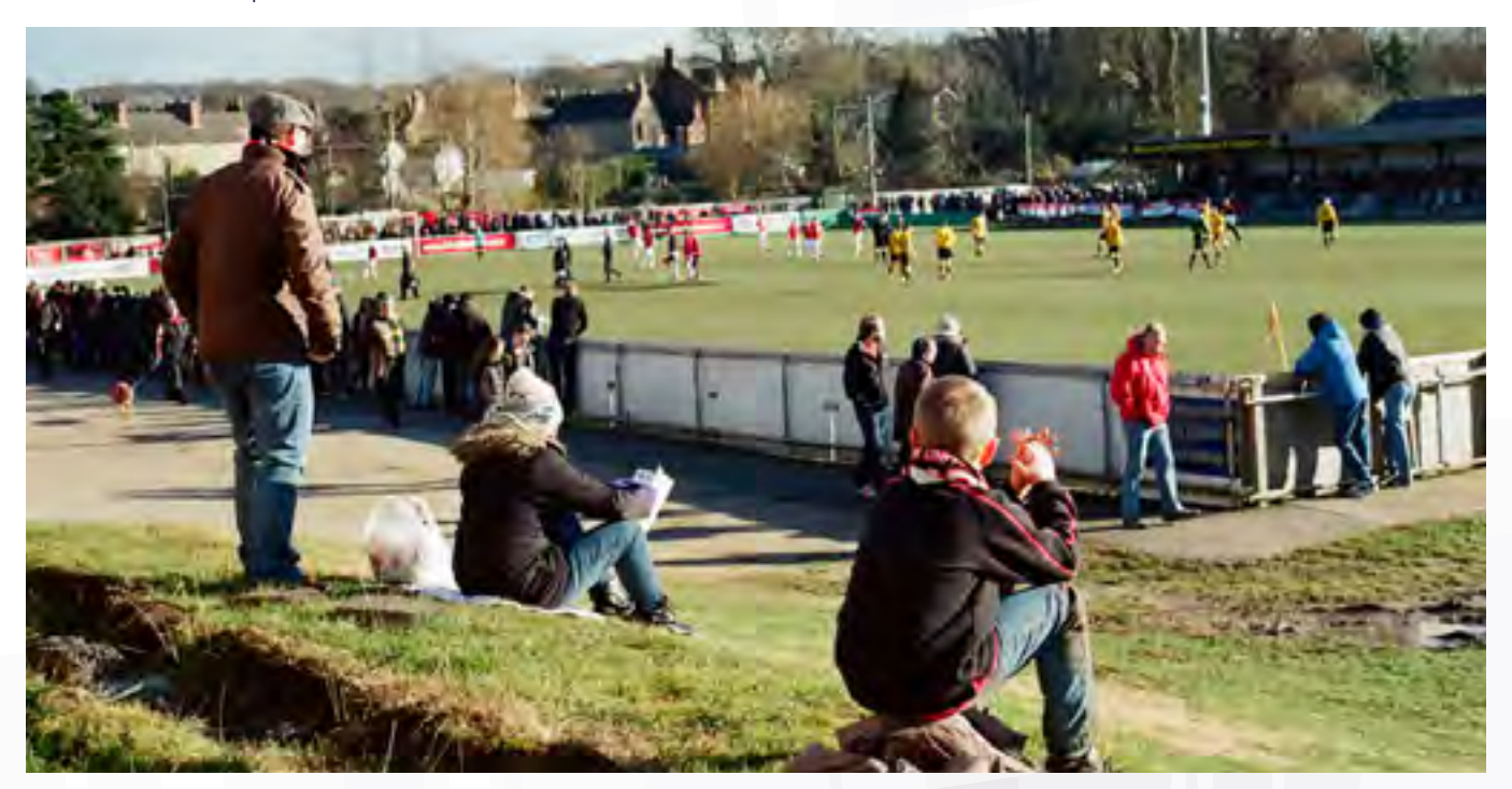
NATIONAL LEAGUE SYSTEM CLUB GUIDANCE: COVID-19 RETURN TO FOOTBALL | page 9

For the foreseeable future, Boardrooms and associated hospitality will not be required to be undertaken by clubs. With this in mind, clubs are encouraged to consider how Boardrooms could be used by players/match officials to support effective social distancing.