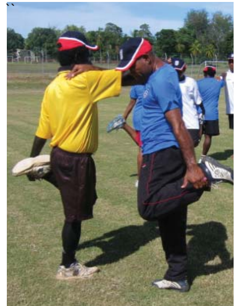
Participants prepare for outdoor work in the Solomon Islands

"The participants were really good to work with. They were open to new ideas and had a lot of fun learning new skills."