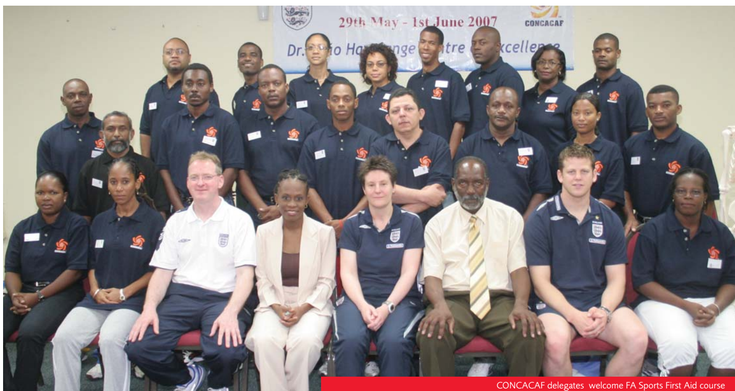
CONCACAF delegates welcome FA Sports First Aid course

The Football Association's Medical and Exercise Science Department delivered a Sports First Aid Course to delegates from CONCACAF at the Dr João Havelange Centre in Trinidad in June.