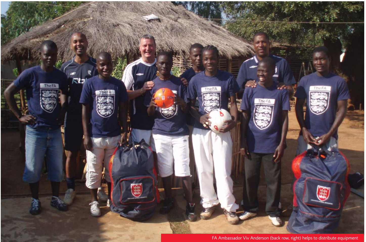
FA Ambassador Viv Anderson (back row, right) helps to distribute equipment