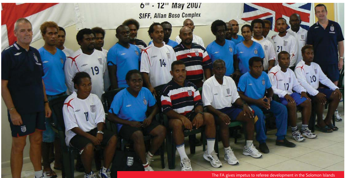
The FA gives impetus to referee development in the Solomon Islands