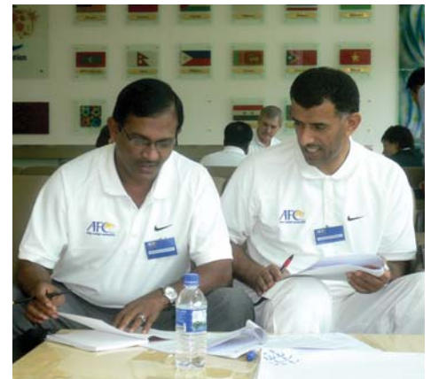
Comparing notes during a break

"I have no doubt that this will be successful as the right people are involved in recruiting, organising and supporting this refereeing project, which will bring widespread benefits to football across the whole continent."