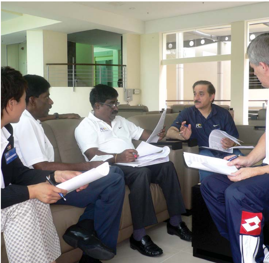
AFC referee recruiter delegates engaging in group-work discussions during the seminar