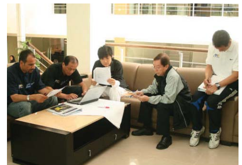
Delegates in a break out session