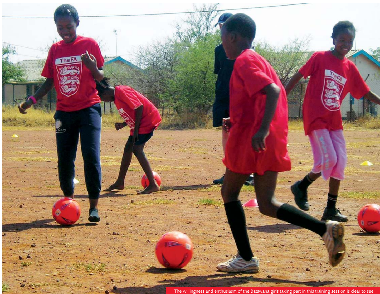
The willingness and enthusiasm of the Batswana girls taking part in this training session is clear to see

The Football Association continued its drive to develop the game at all levels around the world with the delivery of two workshops in Botswana in October.