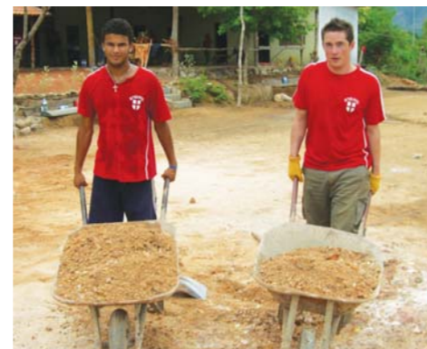
The FA supports the Bobby Moore Fund's Project Brazil as part of The FA's 2006 Charity Partnership with Cancer Research UK.