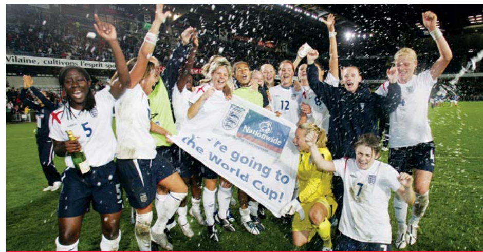
England's players celebrate World Cup qualification following their 1-1 draw with France in Rennes

The England women's team have qualified for the FIFA 2007 Women's World Cup™ in China after drawing 1-1 with France in their final match to finish top of Group Five.