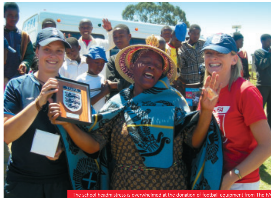
The school headmistress is overwhelmed at the donation of football equipment from The FA

"We took three England team players to Malawi earlier this year – Rio Ferdinand, Gary Neville and David James – and the impact they had as footballers in terms of disseminating HIV awareness messages was immense."