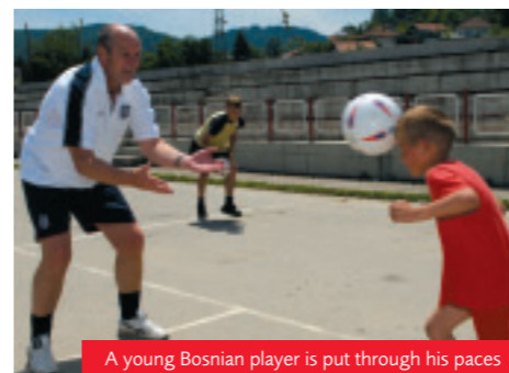
A young Bosnian player is put through his paces