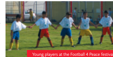
Young players at the Football 4 Peace festival

This festival, pioneered by the University of Brighton and funded by the British Council, brought together children from the Arab, Jewish, Christian and Druze communities, showing how the power of football can unite and break down barriers. Over 800 children took part in the event, which included a girls' football tournament for the first time.