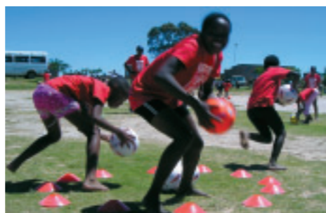
Girls from the Macheoaneng Primary School get their first taste of football training