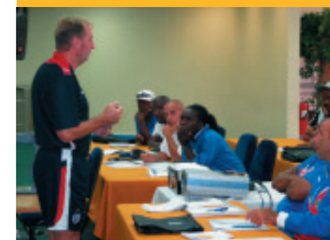
The course, conducted annually for CONCACAF, was attended by coaches from across the Caribbean.