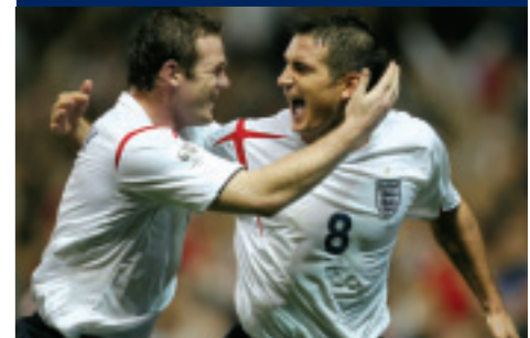
Wayne Rooney and Frank Lampard celebrate against Poland

"We have an extremely good team," said Eriksson. "I am extremely confident England will have a very good World Cup. We are one of four or five teams who can win the World Cup. If we are lucky with injuries, I think we can do it."