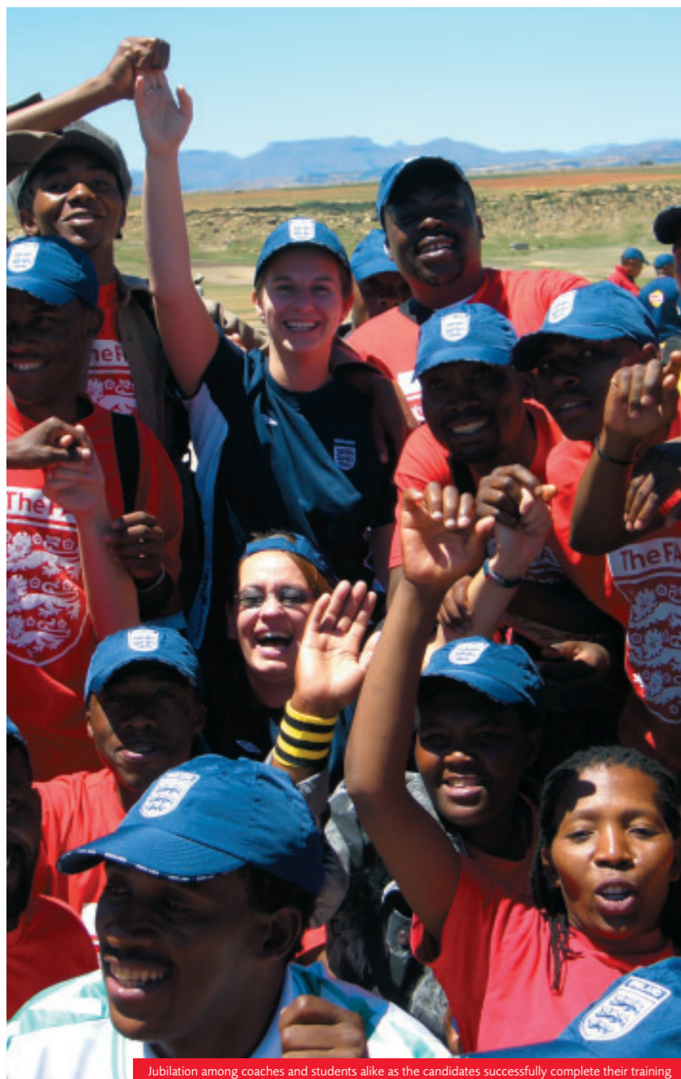
Jubilant among coaches and students alike as the candidates successfully complete their training