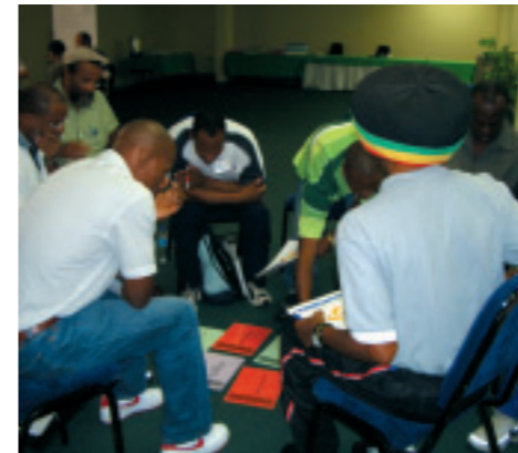
Trinidad & Tobago have never before appeared at a World Cup Finals; the work starts now for Germany 2006 and beyond

"Qualification should ultimately benefit the grassroots of the game here which is actually critical for the future of football in this country and across the region. Appearing at the World Cup will increase participation and interest in the game. It will create new heroes and role models which will give football development a new direction here."