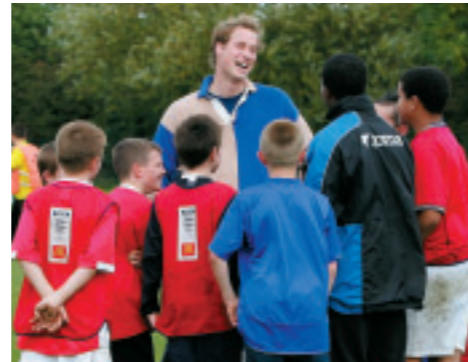
HRH Prince William, who takes over as President of The FA in May 2006, talks with youngsters at Charlton Athletic FC's training ground in London.