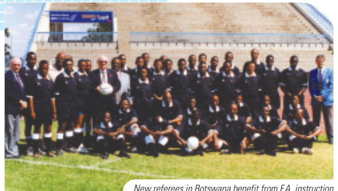
New referees in Botswana benefit from F.A. instruction

■ Cameroon – F.A. support of the VSO Community Sports Project enters its third year, promoting health and education through sport.