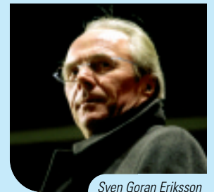
Sven Goran Eriksson

Last October, The F.A. appointed Sven Goran Eriksson as the first ever non-English coach of the England team: