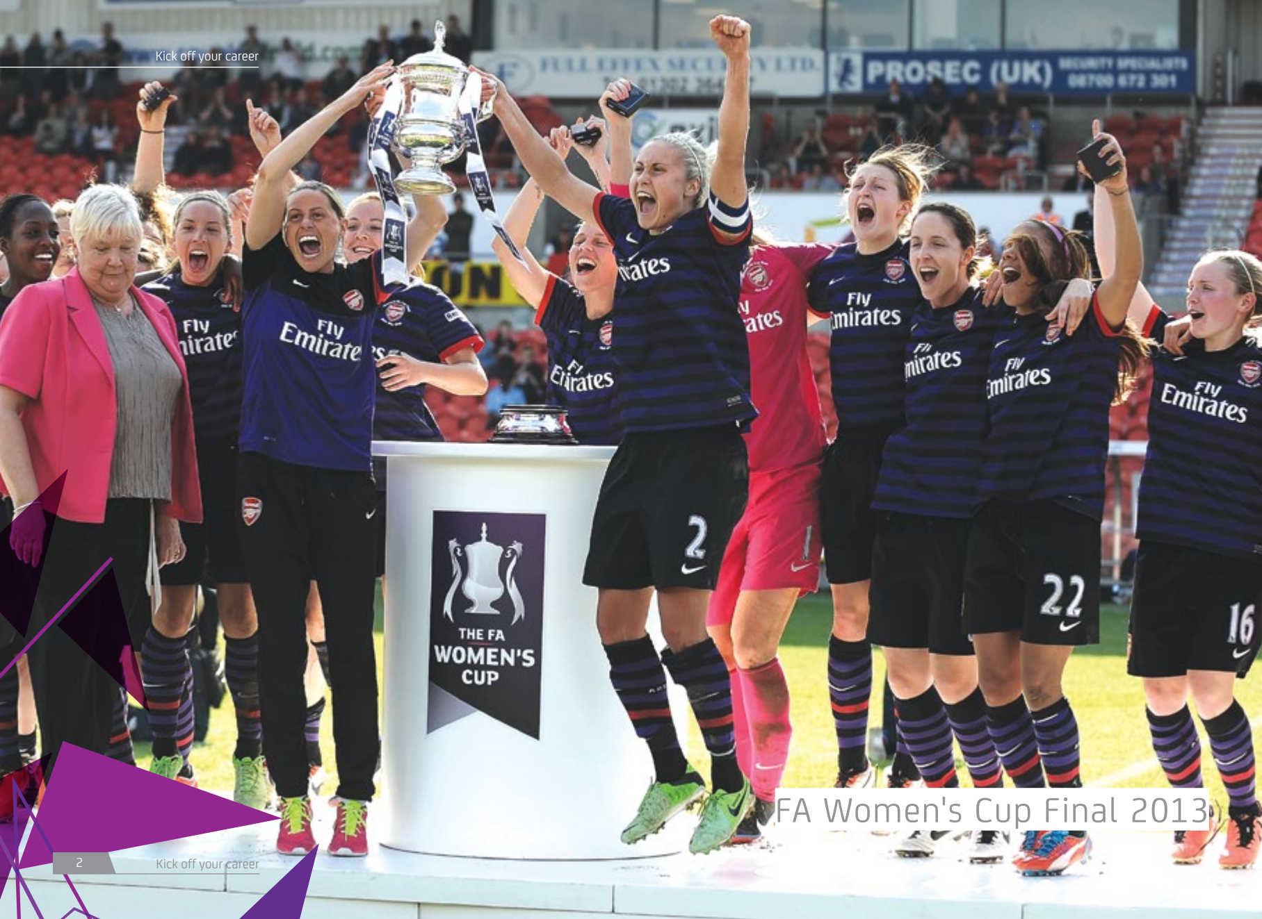
FA Women's Cup Final 2013