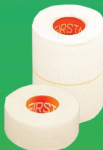
Elasticated Adhesive Bandage From £1.38