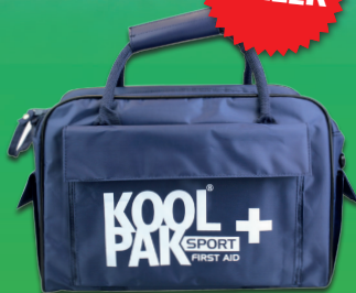
Team Sports First Aid Kit £27.76