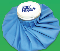
Ice Bag £3.94