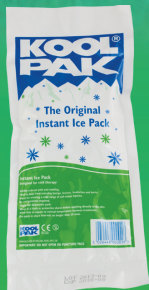
Original Ice Pack From 78p per pack