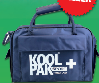
Team Sports First Aid Kit £27.76