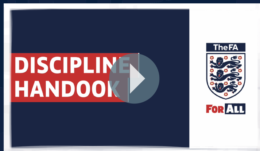
Reporting Discrimination Grassroots Supporters