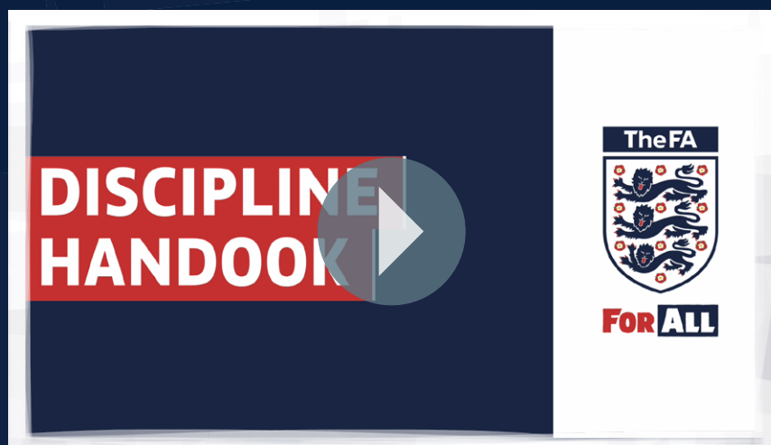
Reporting Discrimination Grassroots Players

The animated films explain how to go about reporting incidents of discrimination – and this has to start at the grassroots level.