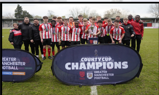
2023 U18 Boys Winners: Altrincham