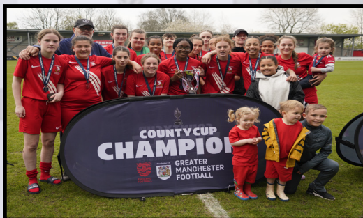
2023 U18 Girls Winners: Droylsden

These competitions offer both male and female players the opportunity to pit their skills against teams from across Greater Manchester, most of whom they wouldn't meet otherwise.