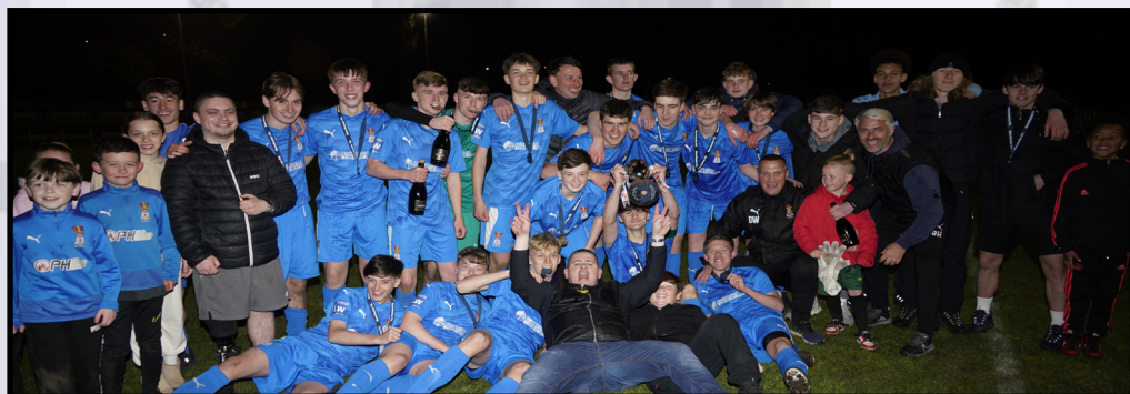
2023 Winners: Irlam JFC

These competitions offer both male and female players the opportunity to pit their skills against teams from across Greater Manchester, most of whom they wouldn't meet otherwise.