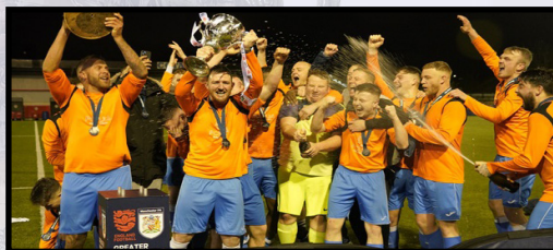
2023 Winners: AFC Middleton