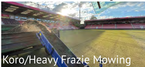
Koro/Heavy Frazie Mowing