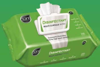
Multi Surface Disinfectant Wipes - £7.33