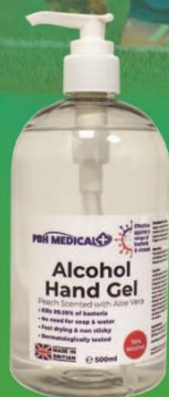
Alcohol Hand Gel - £4.24