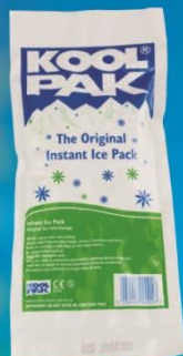
Koolpak Original Ice Pack - As low as 59p per pack