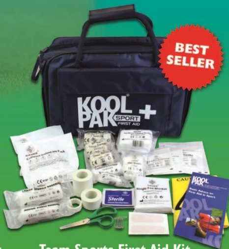
Team Sports First Aid Kit - £20.45