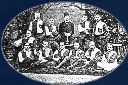
The Reading FC team that beat Marlow FC in 1879 to become the first ever winners of the Berks & Bucks FA Senior Cup.

The Reading Chronicle of March 27th 1879 reported on the first ever Berks & Bucks FA Senior Cup, then known as the 'Challenge Cup', as follows: