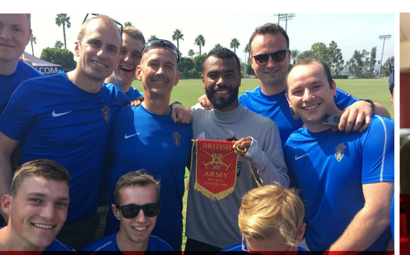
Army Crusaders presenting the Army Football Pennant to Ashley Cole, formerly of Chelsea, Arsenal and England at LA Galaxy training ground

Overall P3 W2 L1 with 1 game cancelled at short notice