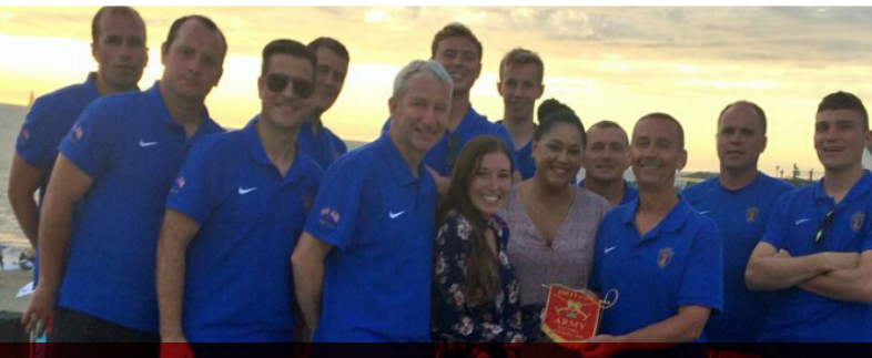
Army Crusaders Presentation to the US Wounded Warrior Project. Redondo Beach LA