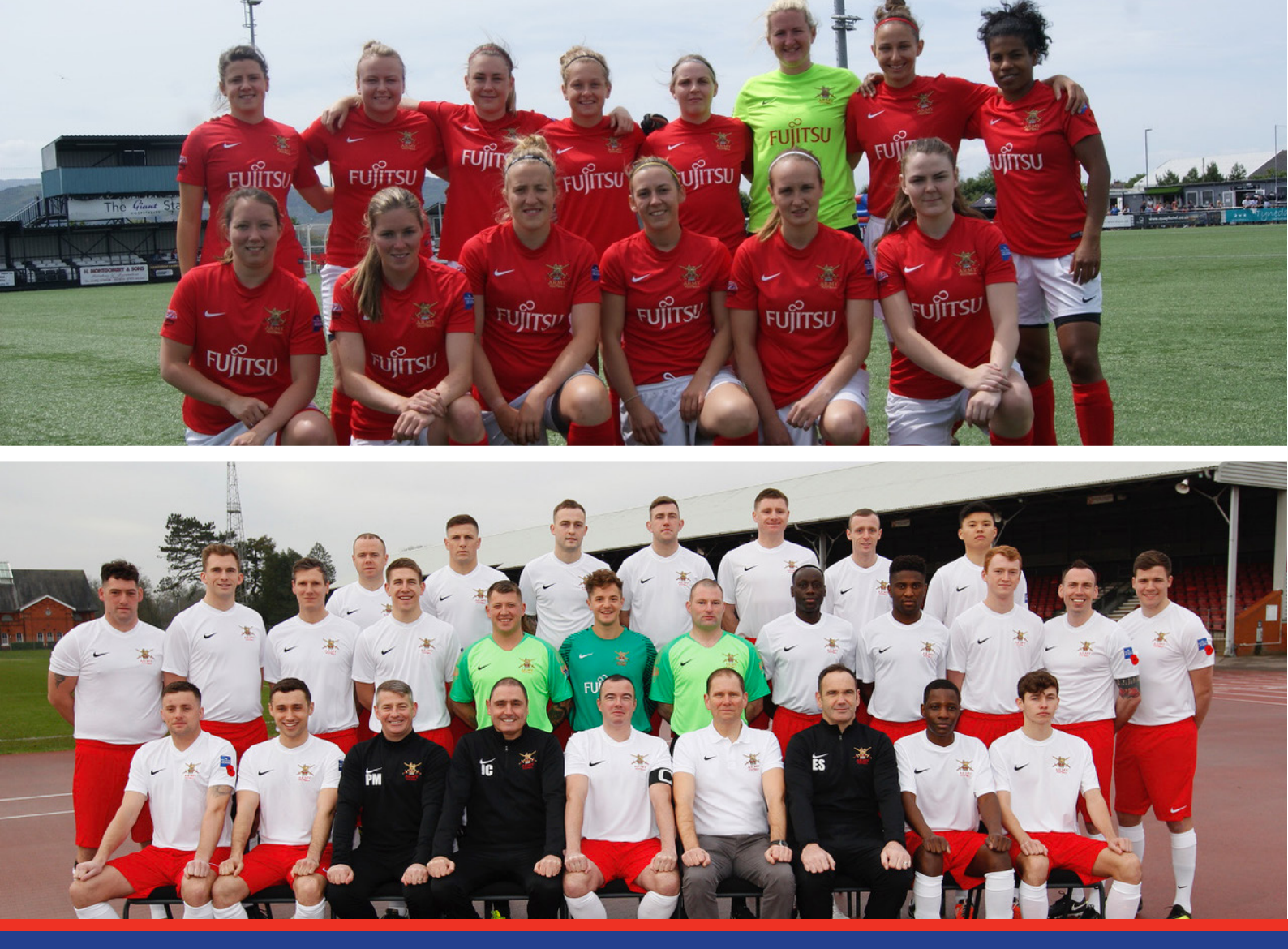
Follow Army Reserve Women on Twitter: @ARWomenFootball

If you would like to know any more about Football in the Army Reserve please email resfootball@ascb.uk.com